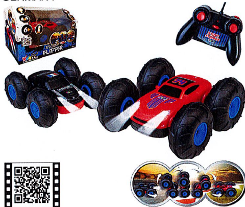
Illustration of article

Authorized representative Happy People GmbH & Co. KG Speicher I, Konsul-Smidt-Str. 8b 28217 Bremen GERMANY